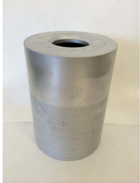
FIG. 4 Specimen Follower