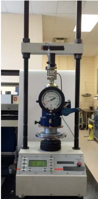
FIG. 3 Hveem Stabilometer Placed in the Testing Machine